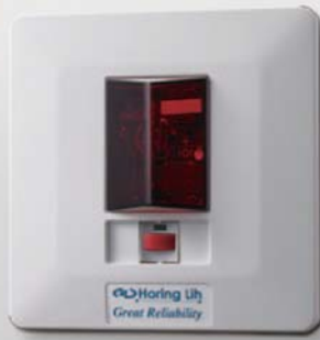
AH-91213 CE approved