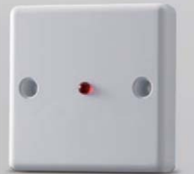
AH-01313 UL listed